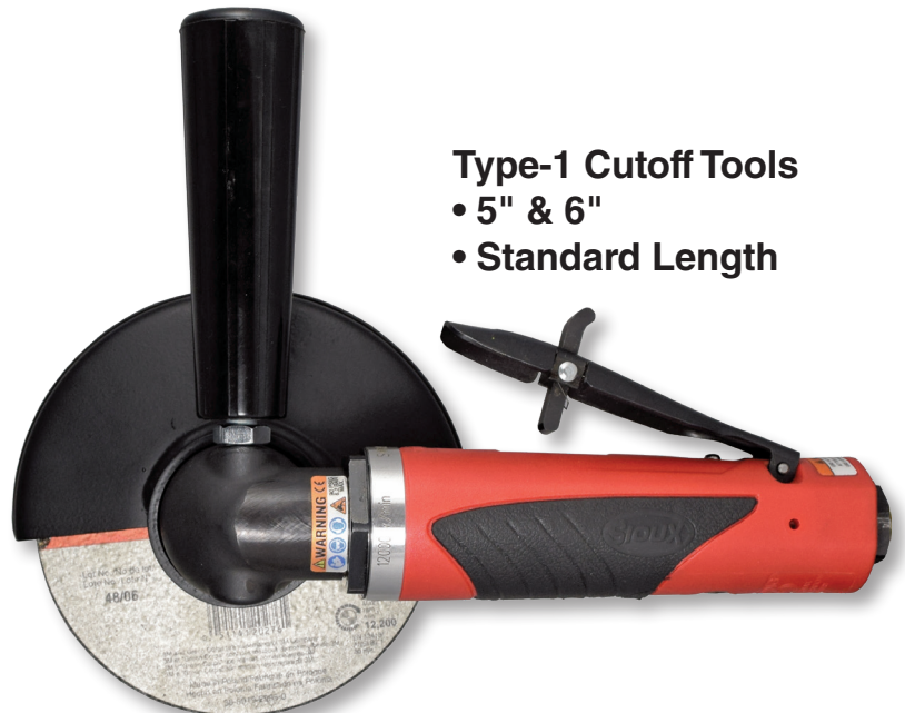
Type-1 Cutoff Tools • 5" & 6" • Standard Length