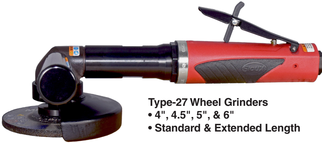
Type-27 Wheel Grinders • 4", 4.5", 5", & 6" • Standard & Extended Length