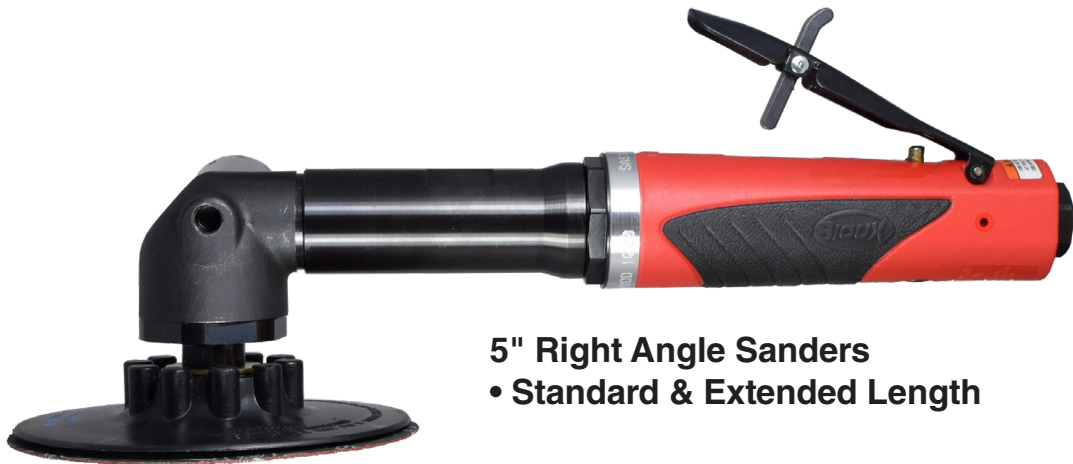
5" Right Angle Sanders • Standard & Extended Length